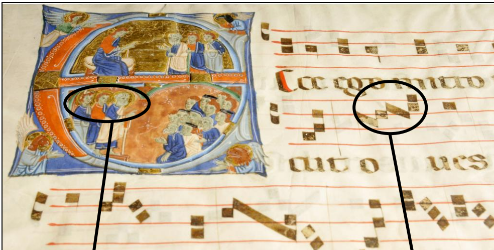
DETAIL OF MEDIA LOSS

As you turn the pages of a bound manuscript, flex the pages as little as possible. Over time, organic materials such as paper, parchment and leather become brittle and can tear easily. Often the ink and decorative colors used for writing, illuminating and decorating a manuscript are no longer firmly attached to the page. This is especially so if the pages are made of parchment, which can have a smooth surface; or, if the pigment binder, such as gum arabic, which adheres the writing inks and decorations to a page, is desiccated or dried. Limiting the flexing while turning pages will reduce wear and tear on the media and support.